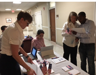
Below: New citizens register to vote using electronic and paper versions of the necessary form.