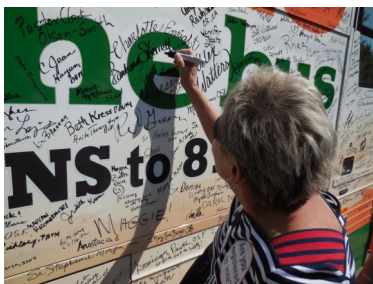
Click on Bus Events , find the Lexington date, and read the account of the nuns’ visit.

The League provided voting information and the opportunity to register to vote for those attending the rally. If you missed the event, check out the website http://www.networklobby.org/bus2014 .