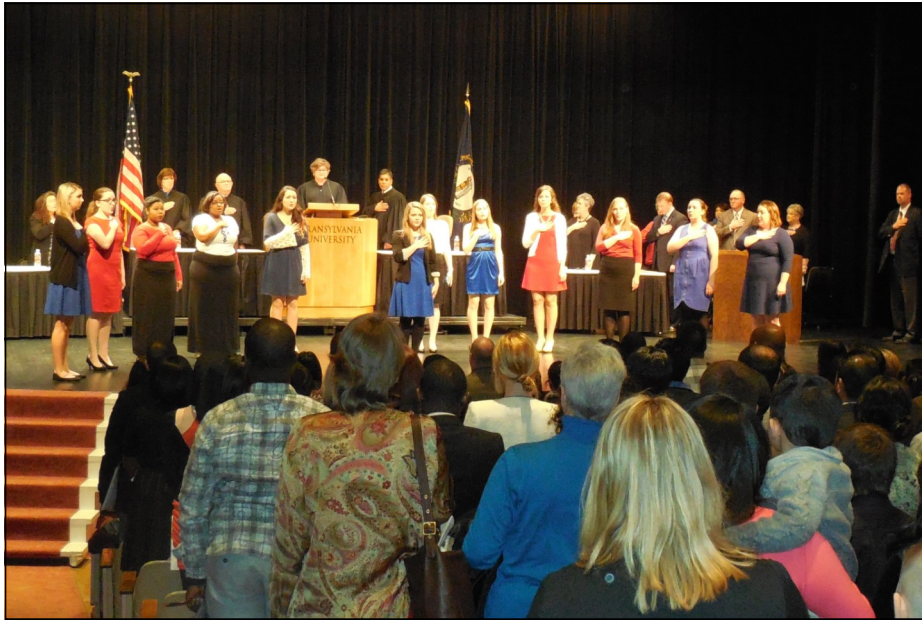
The Grace Notes, Transylvania University women's acapella group, provided patriotic music for the 168 citizenship applicants and their family and friends at the recent naturalization ceremony.