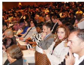
Faces from many countries