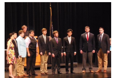
Music provided by Transylvania University a cappella choir